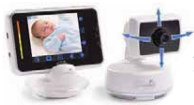
Baby Touch™ Digital Color Video Monitor

Source: Recommendations by the American Academy of Pediatrics, the Consumer Product Safety Commission and the National Institute of Child Health and Human Development.